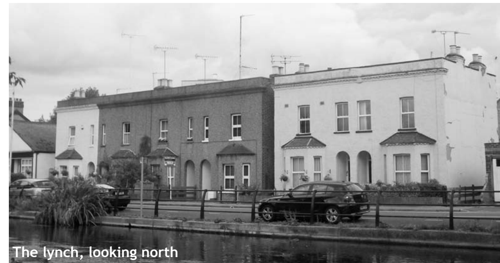
The Lynch, looking north