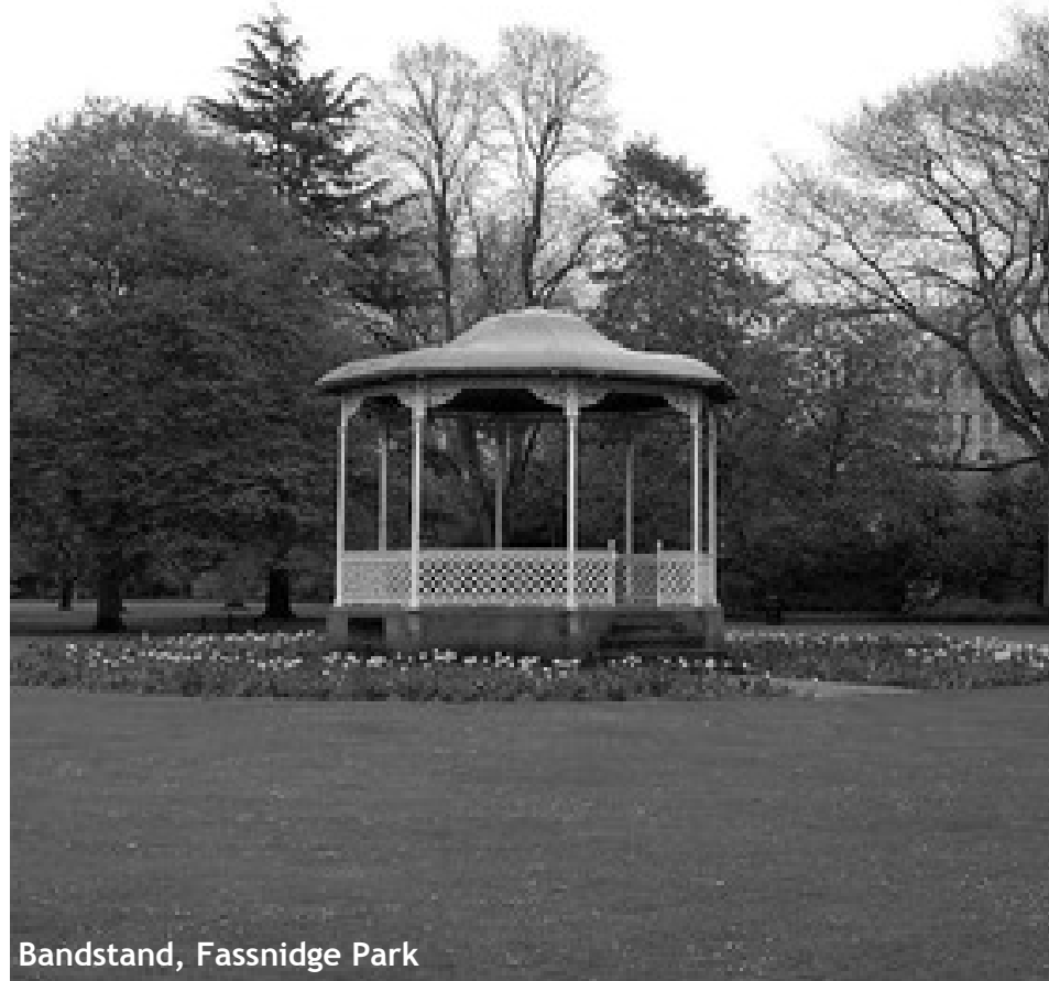
Bandstand, Fasnidge Park