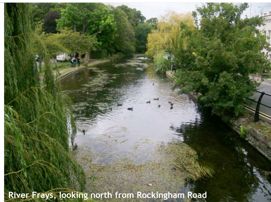
River Frays, looking north from Rockingham Road