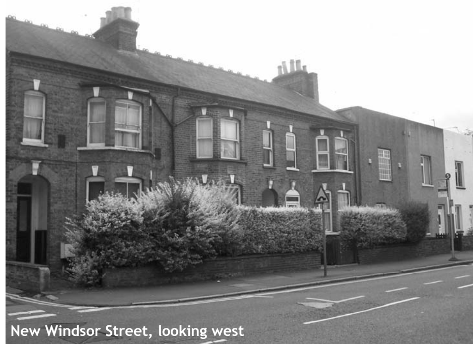
New Windsor Street, looking west